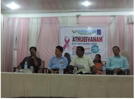
Fig: Inauguration of Breast cancer awareness seminar 'Athijeevanam