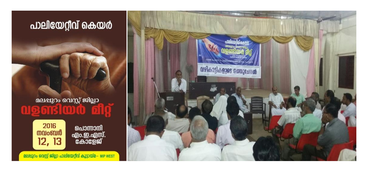
Fig; A glimpse from the Malappuram District Palliative Vollunteer meet.

Palliative unit members provided volunteer support for the successful conduct of the two day Mallappuram District Volunteer meet held at MES Ponnani College Auditorium on 12 & 13 November 2016. Almost 550 active volunteers from whole of Malappuram attended the meet. The students provided whole hearted support for the successelful conduct of the program and had fruitful interactions with senior volunteers.